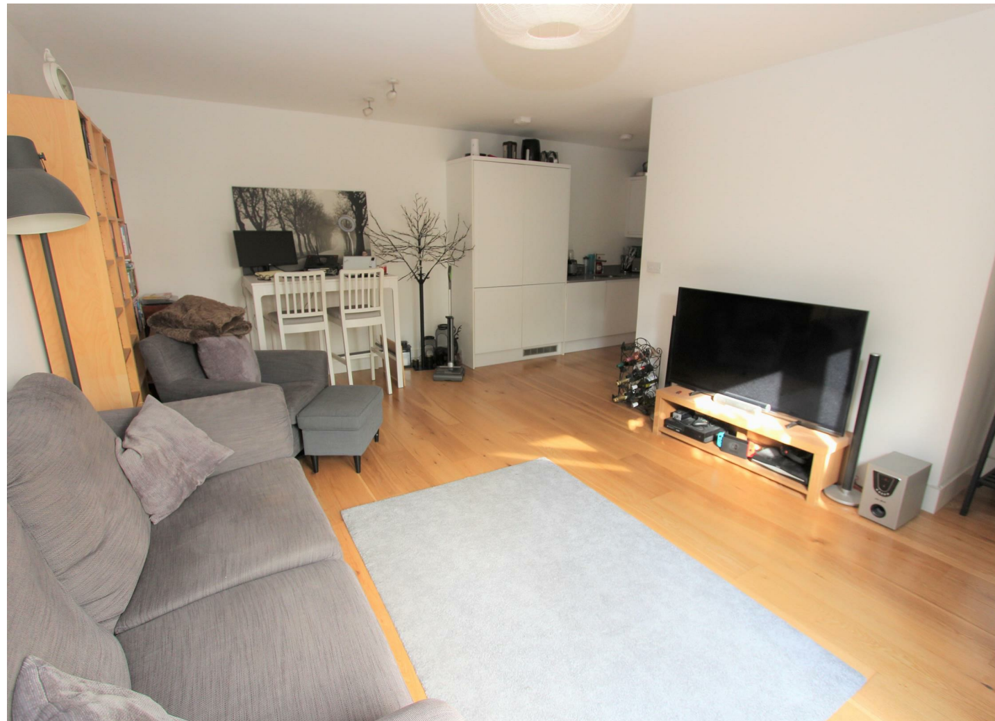
Lounge Area 17'4 x 15'3